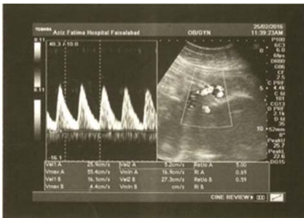
Fig 1: Raised S/D ratio in umbilical artery in IUGR fetus

All the patients in study were followed till delivery and maternal and fetal outcomes were noted in both groups. The maternal outcome was measured in terms of preterm delivery (birth of a baby at less than 37 weeks of gestation), mode of delivery and induction of labour. The perinatal outcome was assessed in terms of birth weight, APGAR score, NICU admission, respiratory distress syndrome, perinatal and neonatal death. All the collected data was entered and analyzed through SPSS v 16. Mean along with standard deviation was calculated for numerical variables. Frequency and percentages were presented for qualitative variables. Independent sample t-test was used to compare means of numerical data and chi-square test for categorical data. The level of significance was set at p -value < 0.05 .